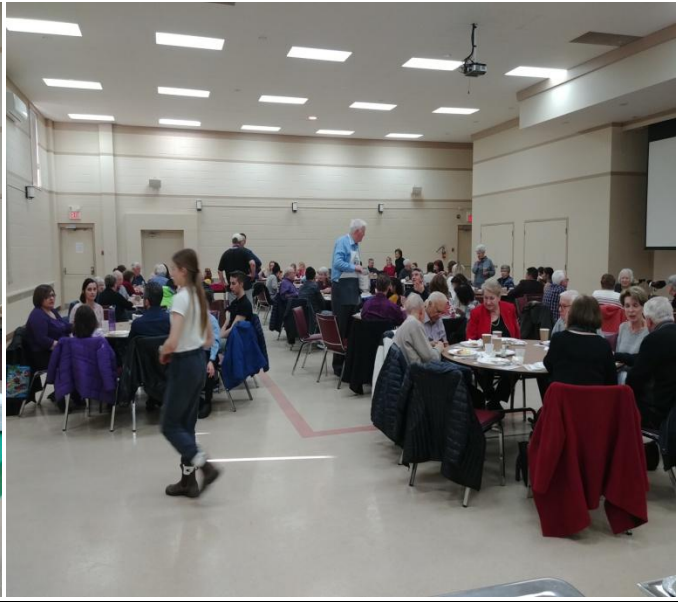
There were over 168 people who attended the parish breakfast between the 2 sittings after mass.